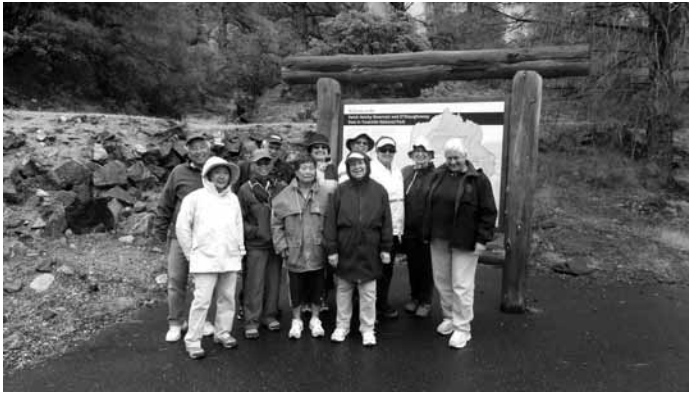
Group trip on June 24 to Hetch Hetchy Valley, the Yosemite sister valley 20 miles north of Yosemite Valley.