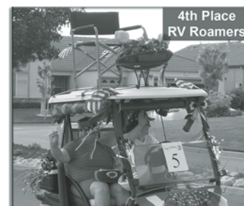
4th Place RV Roamers