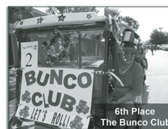
6th Place The Bunco Club