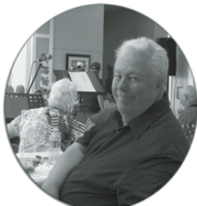
Norman Richardson, Mayor City of Rio Vista