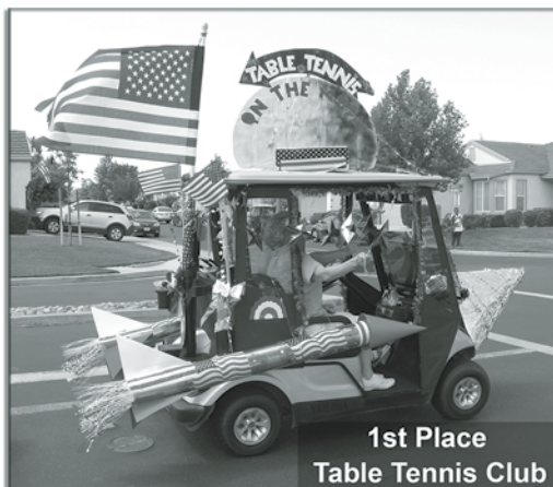
1st Place Table Tennis Club