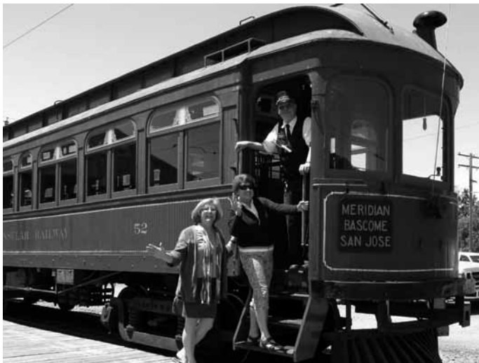
Ride the Rails at All Aboard For CARE