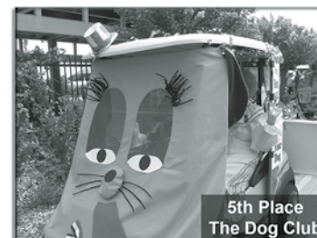
5th Place The Dog Club