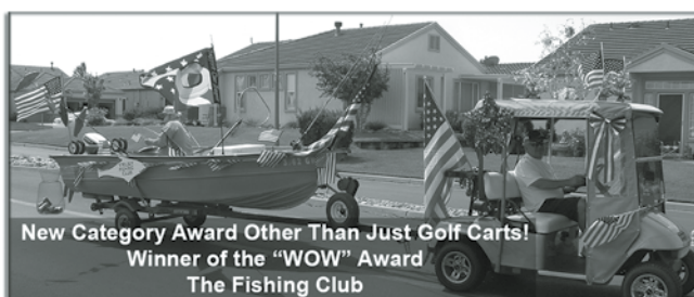
New Category Award Other Than Just Golf Carts! Winner of the "WOW" Award The Fishing Club