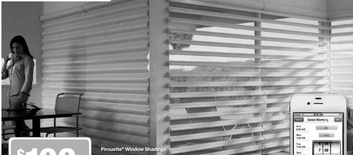
Pirouette® Window Shadings