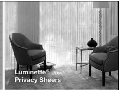
Luminette® Privacy Sheers