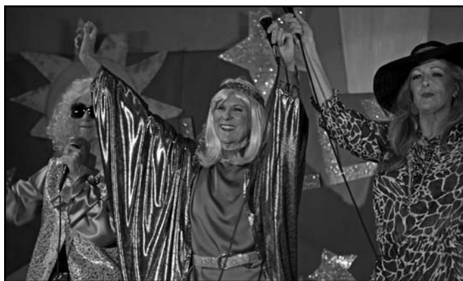
This year's "Music of the Night" was a great success!