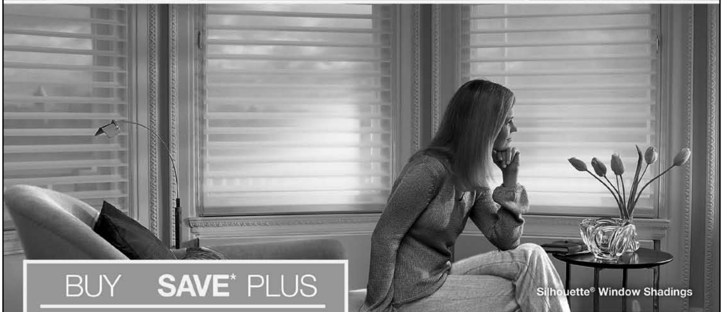
Silhouette® Window Shadings