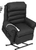
Lift Chairs Starting at $788

We Take Care of All Your Medicare Claims