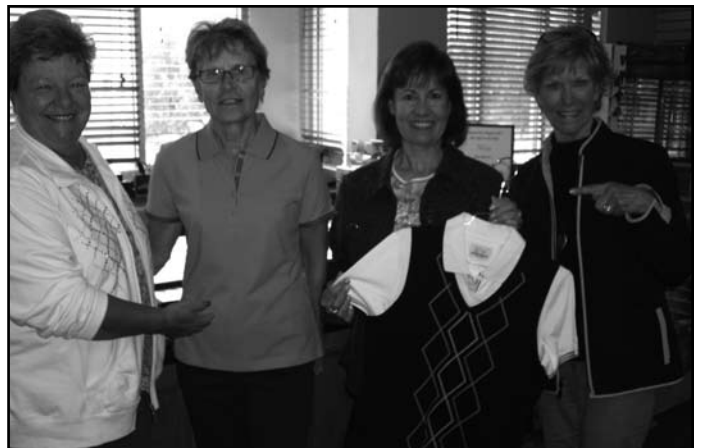
Womens' 9-Holers receive new shirts.