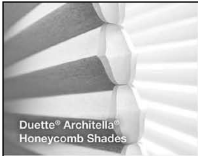
Duette® Architella® Honeycomb Shades