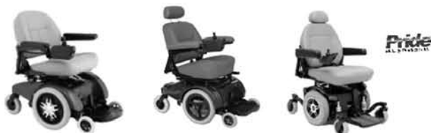
Electric Wheel Chairs Starting at $1888